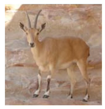
Nubian Ibex (Capra nubiana)

The Ibex feeds on herbs, shrubs and tree foliage and drinks water daily if available. It inhabits mountainous terrain and is considered threatened on the national and international level, mainly due to Illegal hunting, which has lead to a sharp decrease in its population. In Jordan, it is protected in two nature reserves, Dana Biosphere Reserve and Mujib Nature Reserve, which has initiated