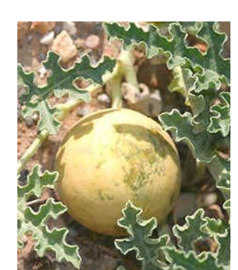
Bitter Apple (Citrullus colocynthis)

The bitter apple is a viny plant native to the Mediterranean Basin and Asia and found throughout southern Jordan. The fruit is extremely bitter and acts as a strong laxative. If consumed in excess, it can cause stomach inflammation and sharp bowel