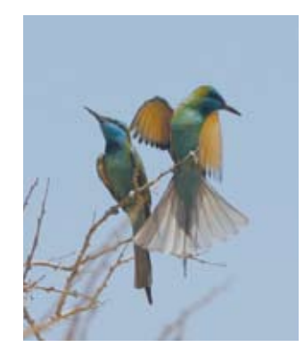
Little Green Bee-eater (Merops orientalis)

This species is primarily an insectivore, feeding on bees, wasps and ants, which it catches in flight. Before swallowing its prey, the bee-eater removes stingers and