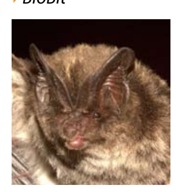
Asian Barbastelle (Barbastella leucomelas)