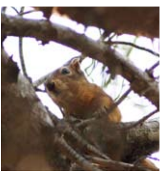
Persian Squirrel (Sciurus anomalus)

The Persian Squirrel is the only representative of the family Sciuridae